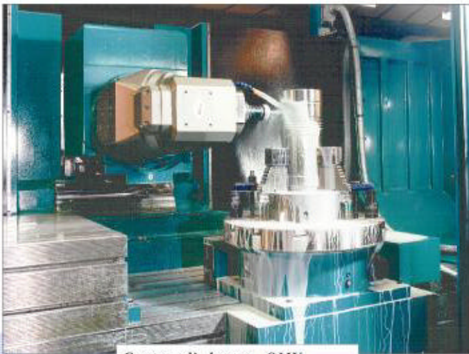
Centro di lavoro OMC a controllo numerico OMC CNC Milling Machine