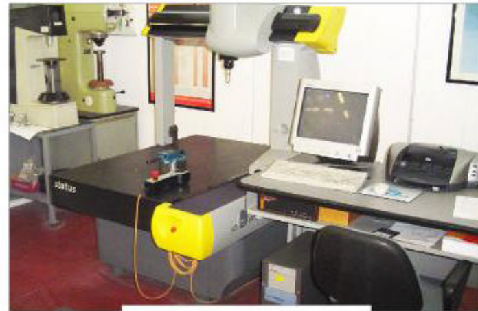
Macchina controllo dimensionale DEA DEA dimensional controll machine