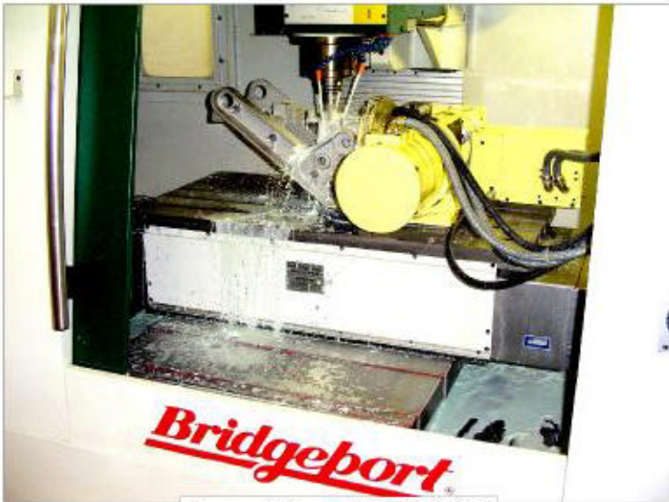
Centro di lavoro BRIDGEPORT a controllo numerico BRIDGEPORT CNC working centre